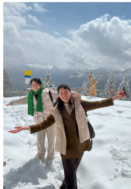
Travel with us to experience breathtaking nature and pure culture of Austria.