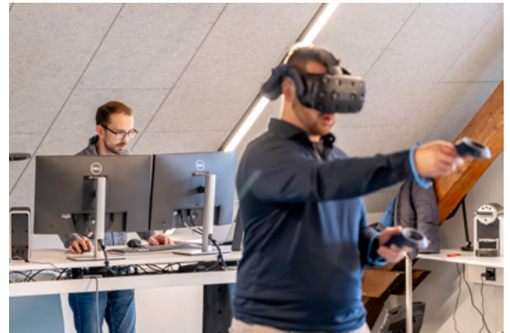
Teach, learn, practice or do all together with our interactive seminars and workshops.