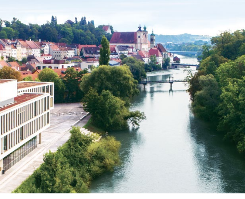
Steyr Campus – Austria's most gorgeous

As if its bold modern architecture right by the river wasn't enough of an eye-catcher. Steyr Campus' three buildings and next-generation DigiSpace boast state-of-the-art working spaces. But there is more to student life than a great campus. It's about the city. And you will fall in love with Steyr.