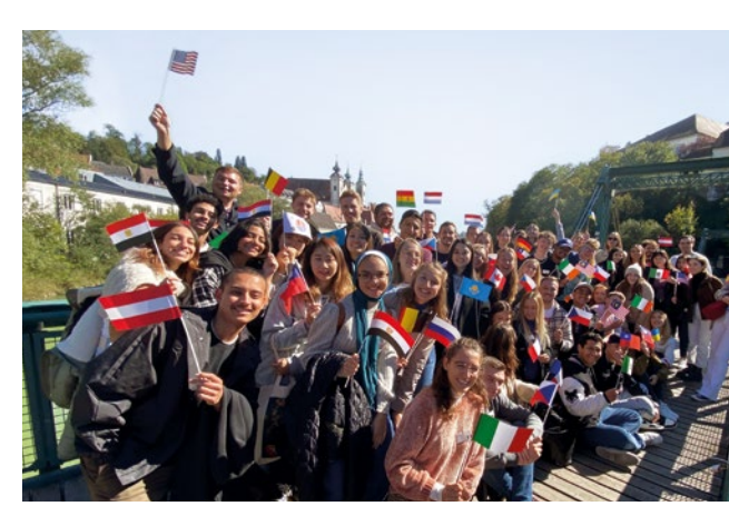
Partner universities across the world