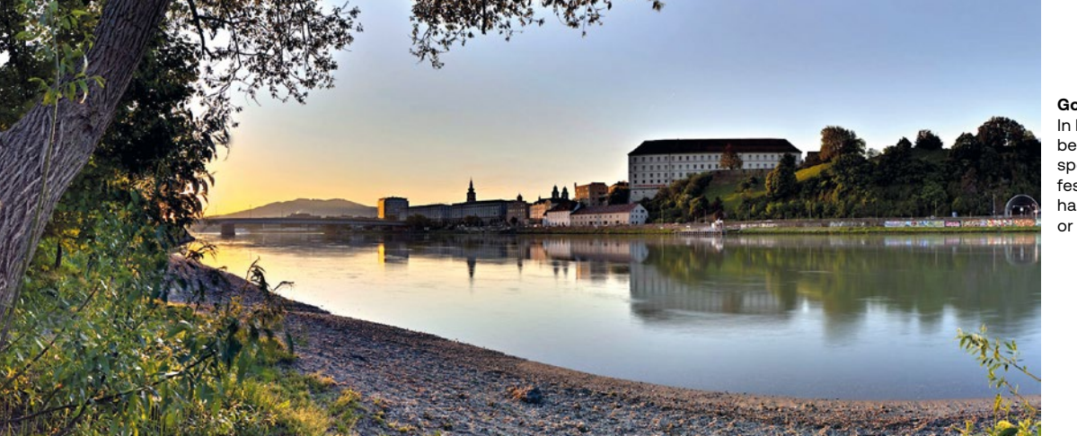
Going with the flow In Linz, everything, from beach-style bathing, and sports activities to popular festivals like Bubbledays, happens by, in, on, along, or near the Danube River