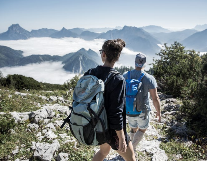
Enjoy breathtaking vistas hiking through the lush green of magical meadows and dazzling mountains → upperaustria.com/en/activities/hiking.html