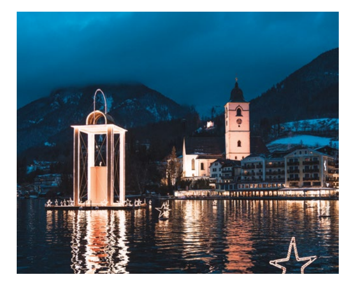
The Advent season turns Austria into a winter wonderland. Christmas fairs grace every town, and the one in St Wolfgang is one of the fairest of all