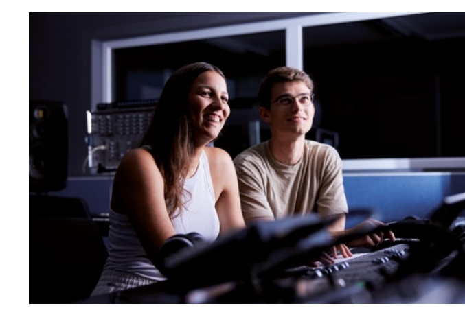
Put theory into practice in our modern, well-quipped film, audio and video editing studios