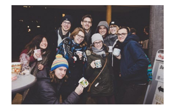
It's that festive time again at our campus winter party with Punsch and Glühwein

No wonder living on campus is a breeze with almost 600 dormitory places as well as many shared apartments and lots of private accommodation in Hagenberg. Commuting to campus is no problem thanks to links to the A7 motorway and public transport. And also within easy reach are the delights of the capital Linz, the lakes and mountains of the Salzkammergut region and cities like Vienna and Prague.