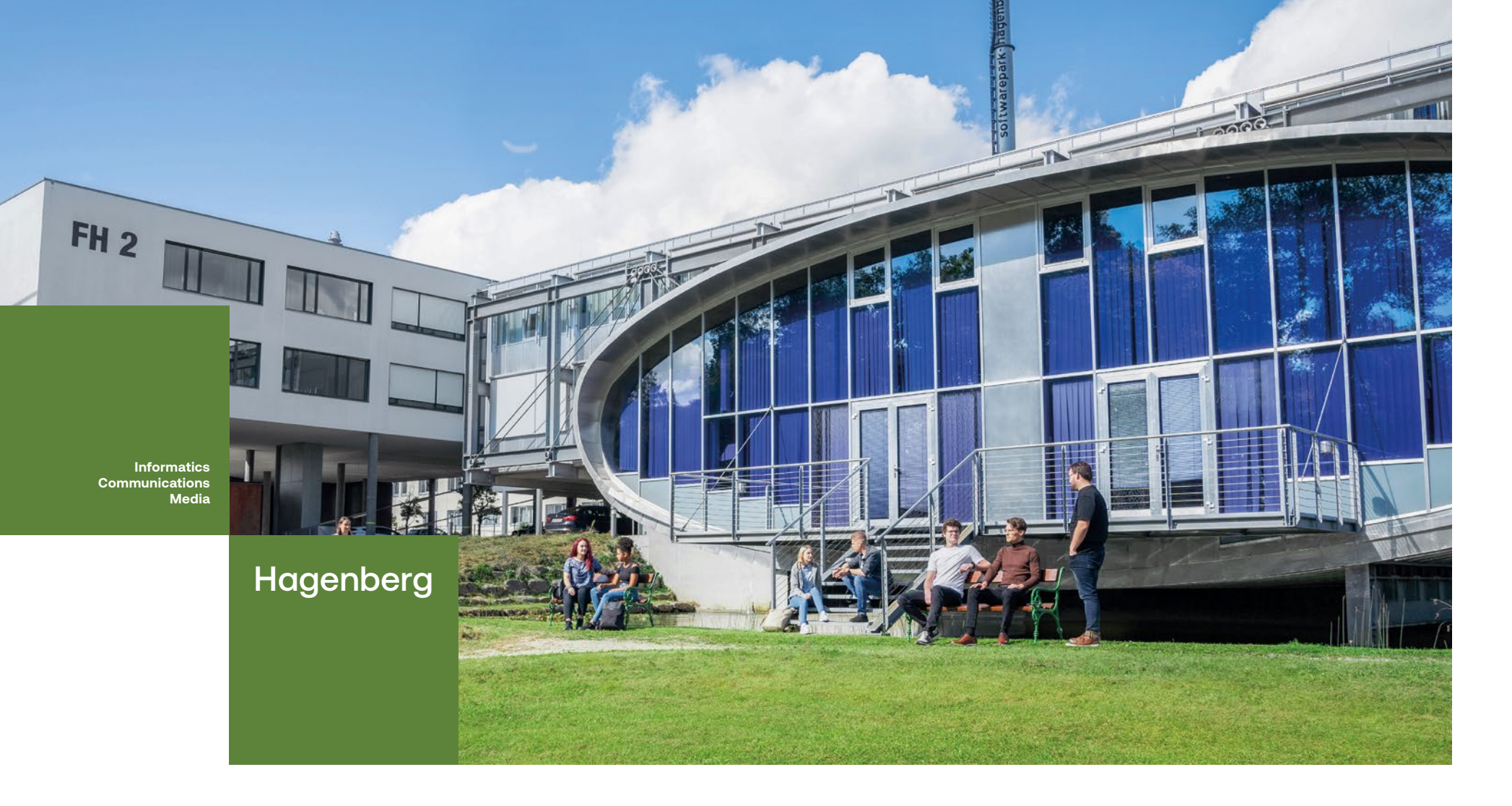
Pure nature outside and the latest technology inside: Hagenberg environment not only for study,