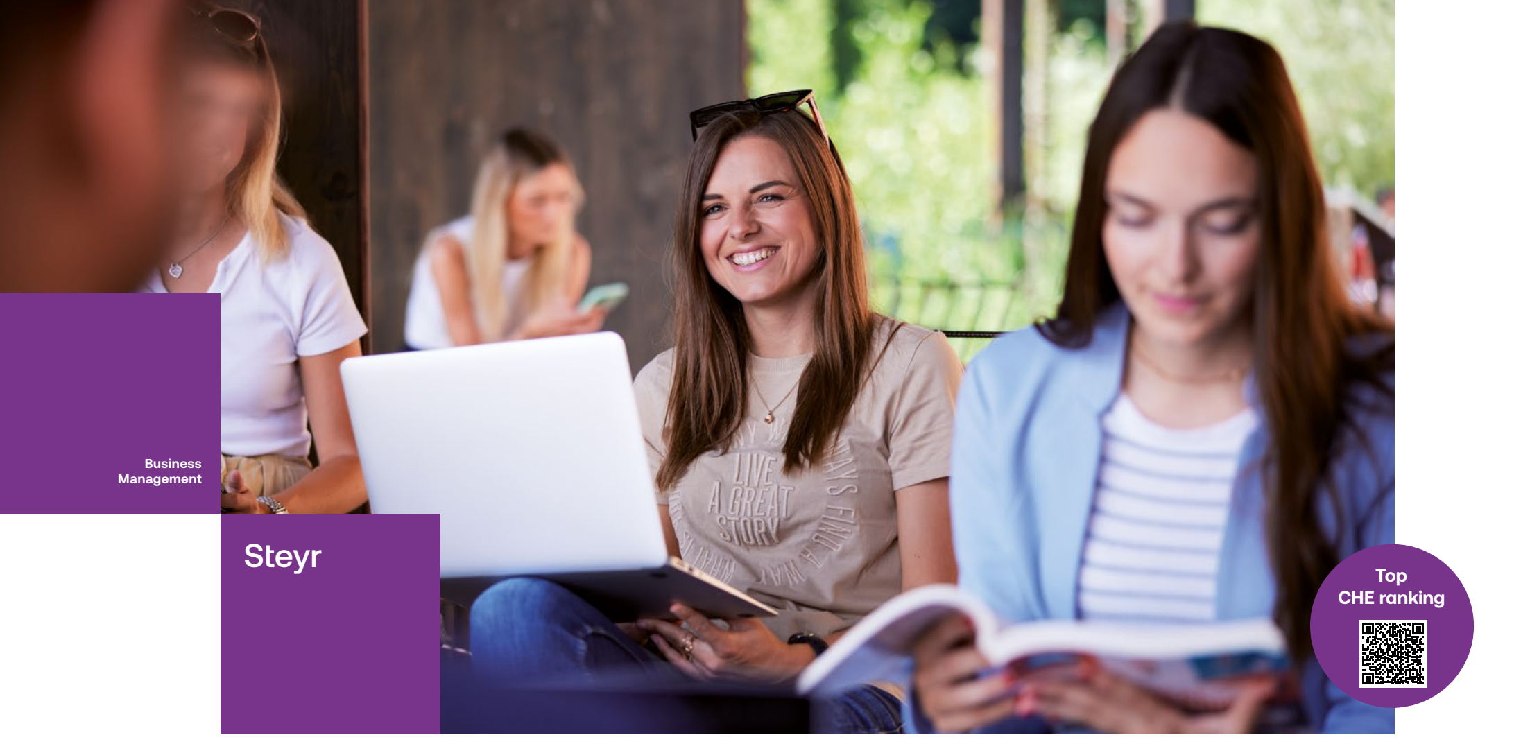
Steyr Campus – A campus (totally)