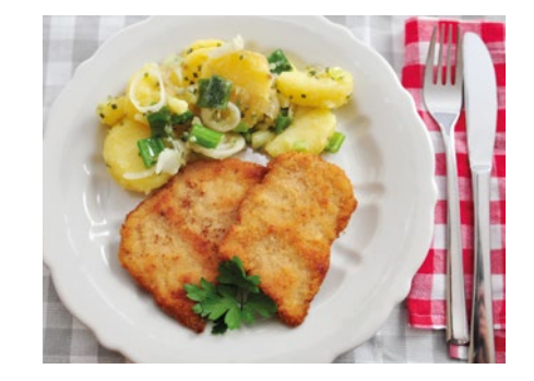
The Wiener Schnitzel is indeed the most popular dish in Austria

Lederhosen – traditional Austrian costume