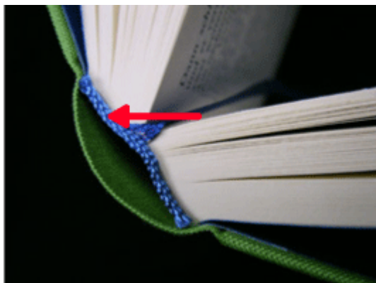
Fig. 1: headband (seen in the spine of the book)

Spiralisation, adhesive binding with hinge strips or rail, foil as a cover or similar types of binding are not allowed and will not be accepted.