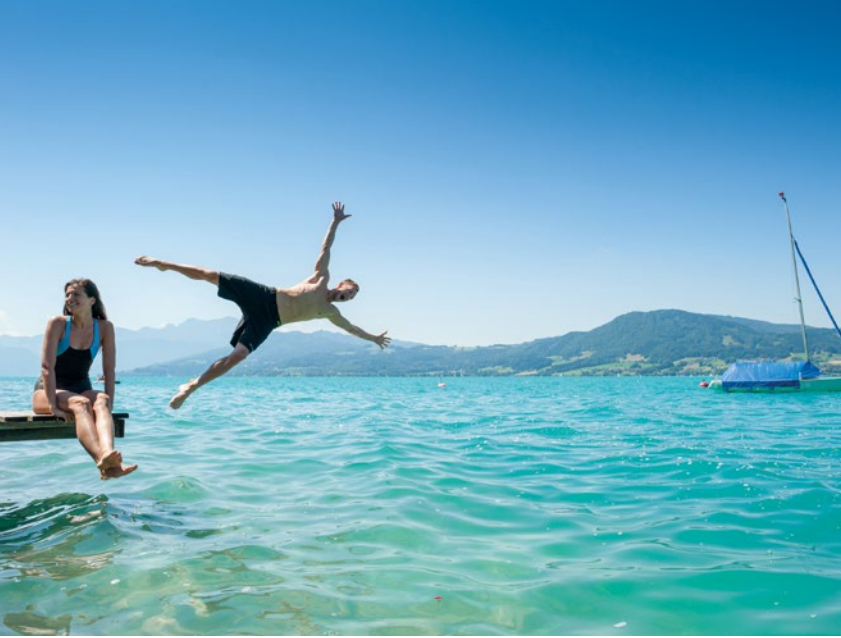
Surrounded by stunning alpine scenery, Upper Austria's crystal-clear lakes beckon to dive right in. → salzkammergut.at/en/