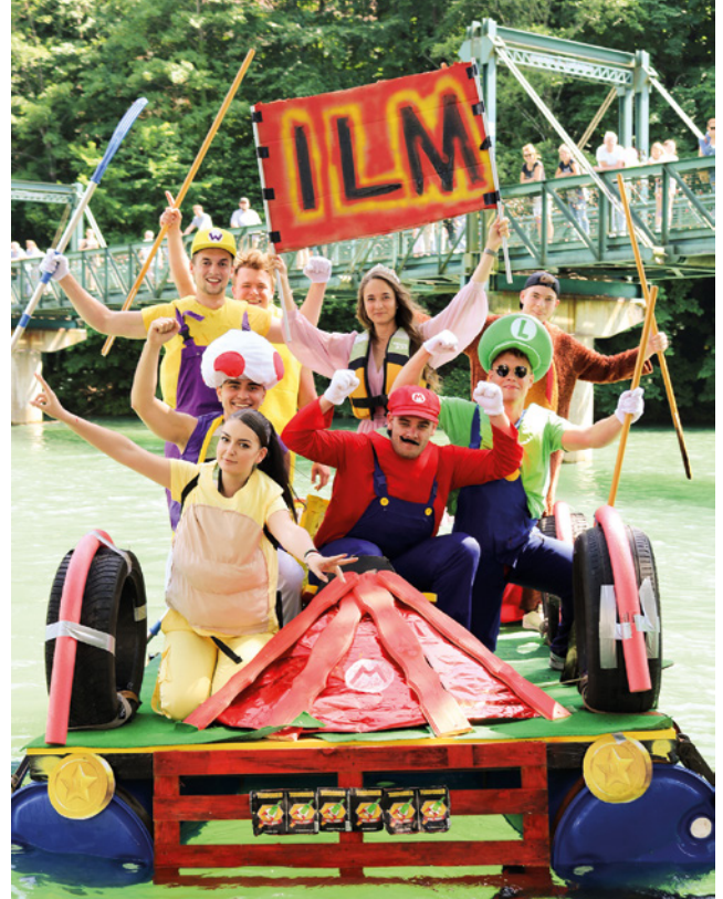
The famous Boatmania.

The following list will help you to find sports facilities, cinemas, activities offered by the student council ÖH and general information about the Upper Austrian Region. Enjoy your stay in Steyr!